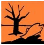
Dangerous for the environment.